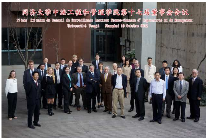
Members of the Supervisory Board, in front of IFCIM, at Tongji University