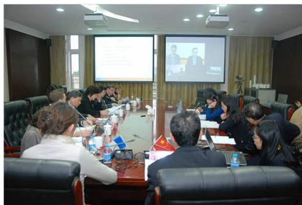
The 2 nd Joint Institutional Board of ParisTech Shanghai Jiaotong

During the JIB were presented the swift progresses made since the signature of the cooperation agreement in April, regarding the organization chart, the budget, the enrolment of elite students, the communication plan, and the accreditation